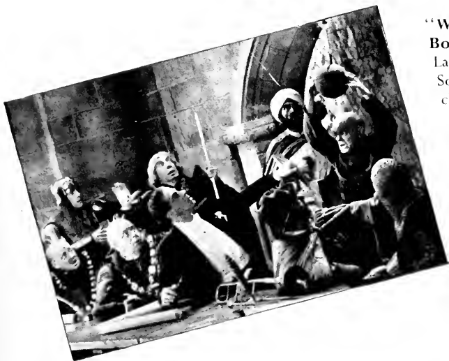
"When Knights Were Bold" (T9101 - 6 reels) Laughter, Romance and Song in the days of chivalry with Jack Buchanan, Fay Wray and Moore Marriott.